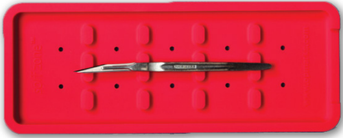
3" x 9" SOFFZONE NEUTRAL ZONE MAT *